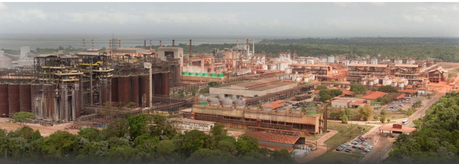
Alunorte in Brazil is the world's largest alumina refinery.

Pareto Aksje Norge has held shares in Norsk Hydro for several years.