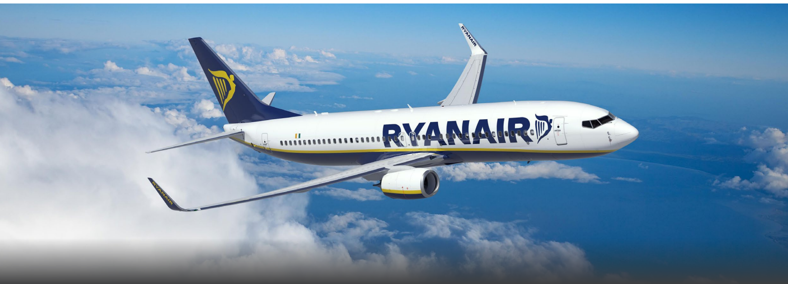
Pareto Global no longer has shares in Ryanair, but the sale is not a result of ESG assessments.

Pareto Global no longer has any shares in Ryanair, so this time we will not spend that many words on the company. We have to add the sale was not triggered by a negative ESG conclusion. Ryanair today recognizes regular unions, and the company has a generally new and fuel-efficient aircraft fleet. It emits a lot of CO2 simply because it flies a lot, but in relative terms, it is among the best in class. By the way, the company has promised to be plastic-free by 2023.