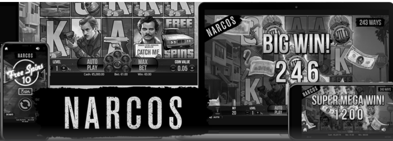
In 2019, NetEnt launched the slot machine Narcos, based on the Netflix series of the same name.

After an overall assessment, we find that Playtech can be in our portfolios. We will nevertheless keep a keen eye on the company and look out for signs of problems arising from the company's products.