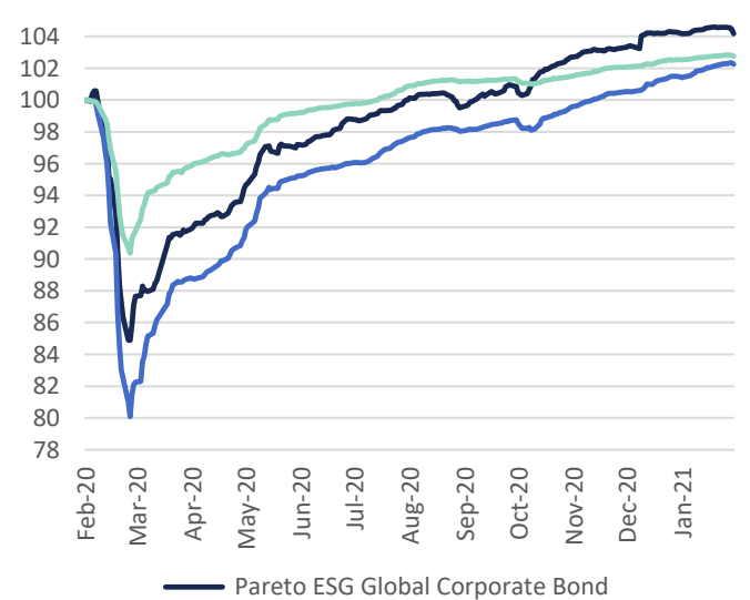
Last 12 months performance in EUR

So far we have not experienced one single default during the pandemic. The latest quarterly figures further indicate a positive momentum for the respective business. We argue that the fund is well positioned in the global high yield market, with its conservative tilt, and poses as an attractive proposition for clients seeking ESG exposure.